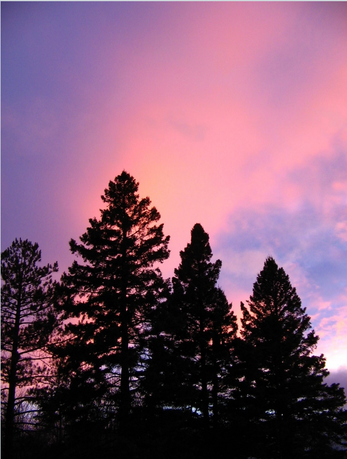
The Valley of Silence, The College of Saint Scholastica, Duluth, Minnesota

A very special thank you photograph dedicated to everyone who contributed to this article!