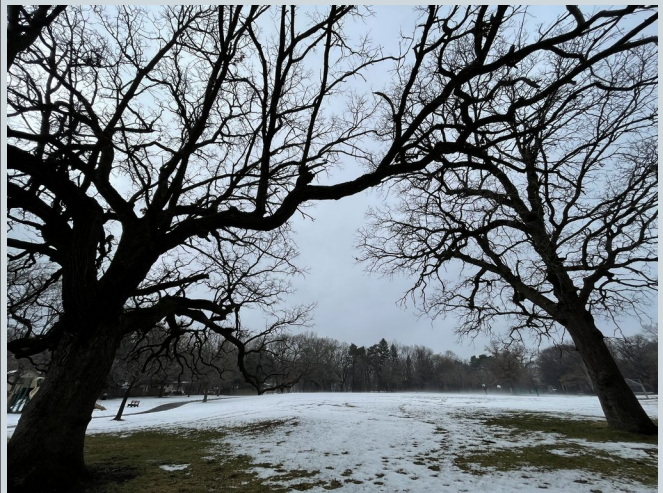
Fog lifting off the snow in Kennedy Park with 250 year old oaks, Fridley, MN