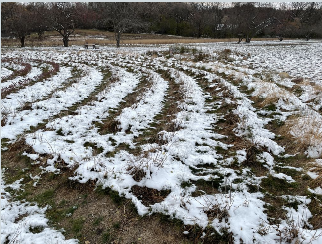
Labyrinth furrows in the snow, Barker's Alps Park, Bayport, MN