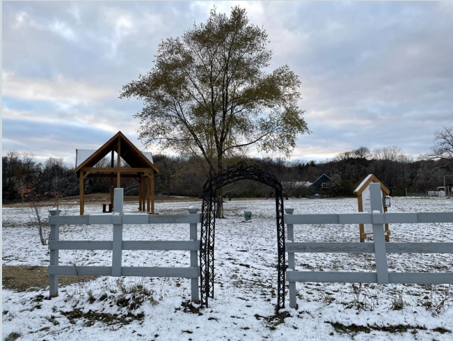
Gate to meditation labyrinth, Barker's Alps Park, Bayport, MN