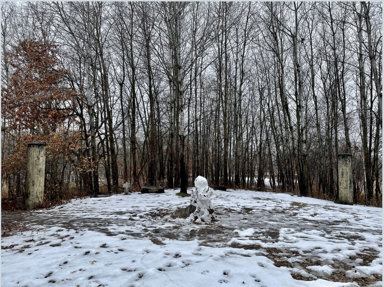
Photo: Solstice Meditation Garden, Springbrook Nature Center, Fridley, Minnesota