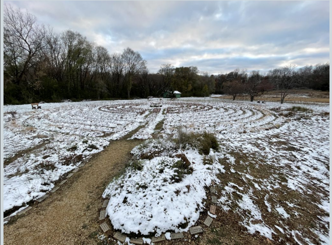
Twelve circuit labyrinth, Barker's Alps Park, Bayport, MN